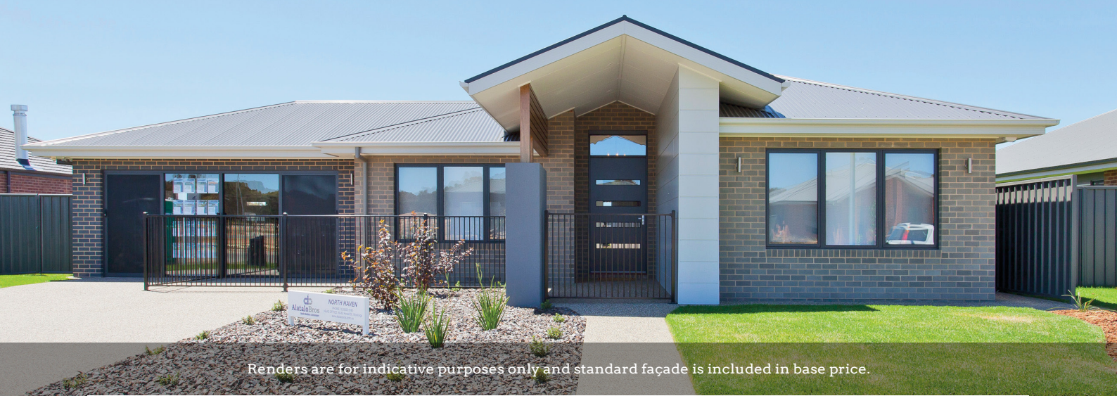
Renders are for indicative purposes only and standard façade is included in base price.