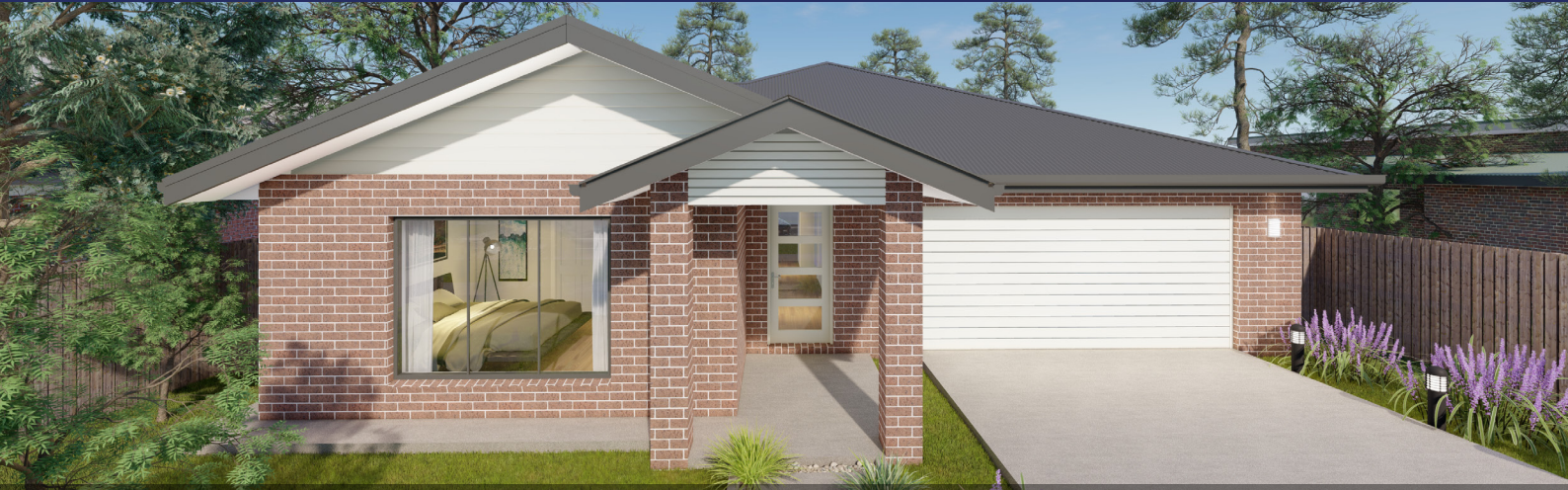
CRAFTSMAN RENDER | Renders are for indicative purposes only and standard façade is included in base price.